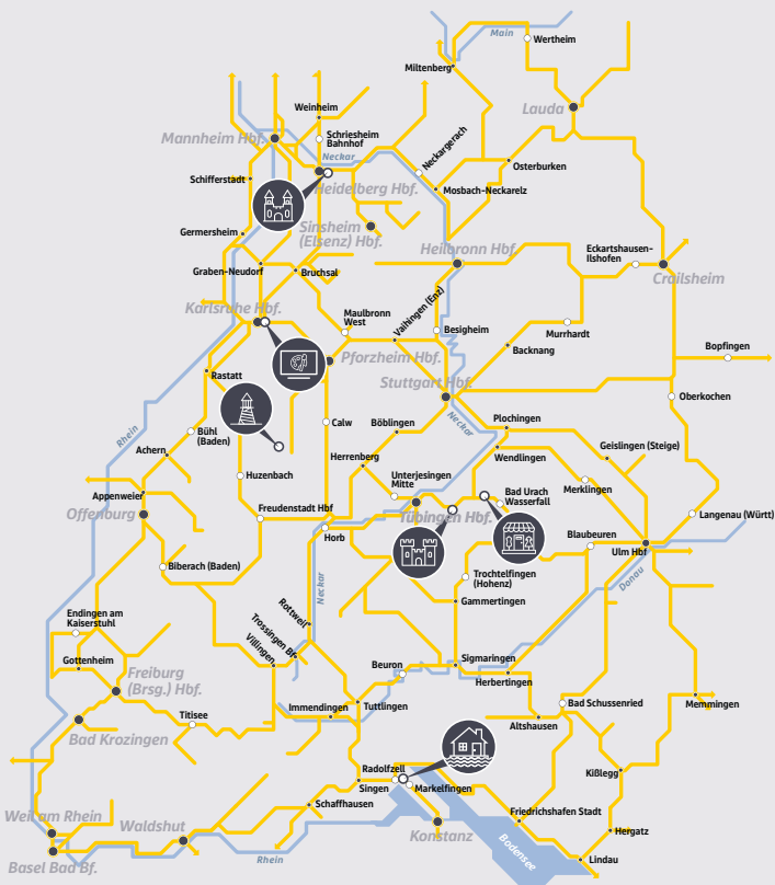
Schematic map of railway lines and rail transport